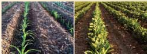
Corn following Oats Safflower following Safflower California Delta - 2010

RESULTS YOU CAN SEE! RESULTS YOU CAN TAKE TO THE BANK!