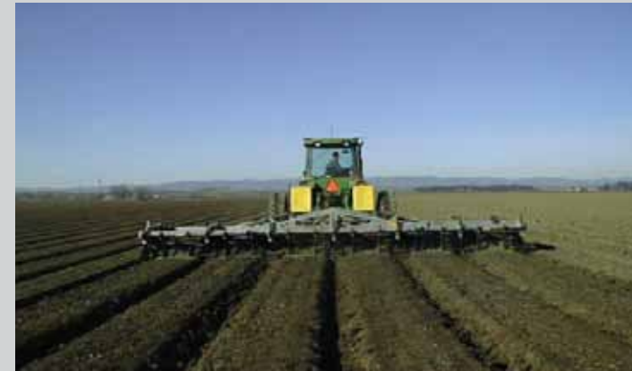
HD PERFORMER - Fall Bed Preparation

PERFORMER: Lists | Shapes | Mulches | Finishes | Side Dresses | Lay By + Drip Tape Tillage Management