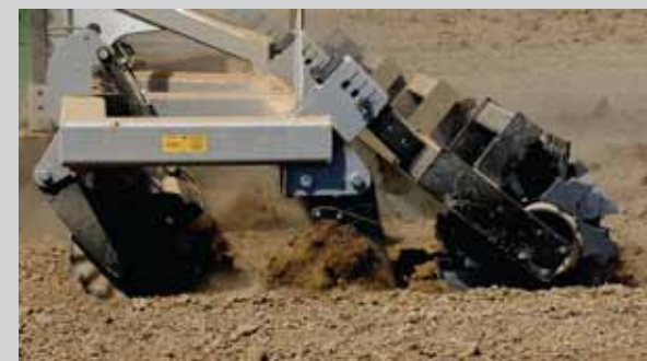
WILCOX IN FURROW CHISEL w/CRUMBLER

Complete Fall and Spring Bed Tillage Strategies Second To None...The Wilcox ADVANTAGE™!