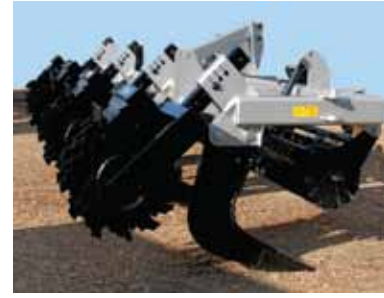
IN FURROW CHISEL w/Crumbler

The WILCOX PERFORMER is incredibly versatile, ground driven mulcher, chisel, bed shaper and more. No more troublesome chain boxes, drive lines, gear boxes and related PTO-driven components to deal with from a machine you use once then park for the rest of the year! It is designed to concentrate the maximum soil fracturing and mulching directly throughout the bed area where next year's crop will root, grow and thrive. It gives you traditional fall and spring bed tillage applications available on this one machine.