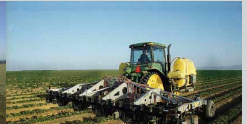
PERFORMER II - Spring Lay by at 7 mph!